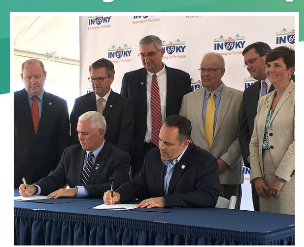
July 2016 - Gov. Pence and Gov. Bevin sign MOA